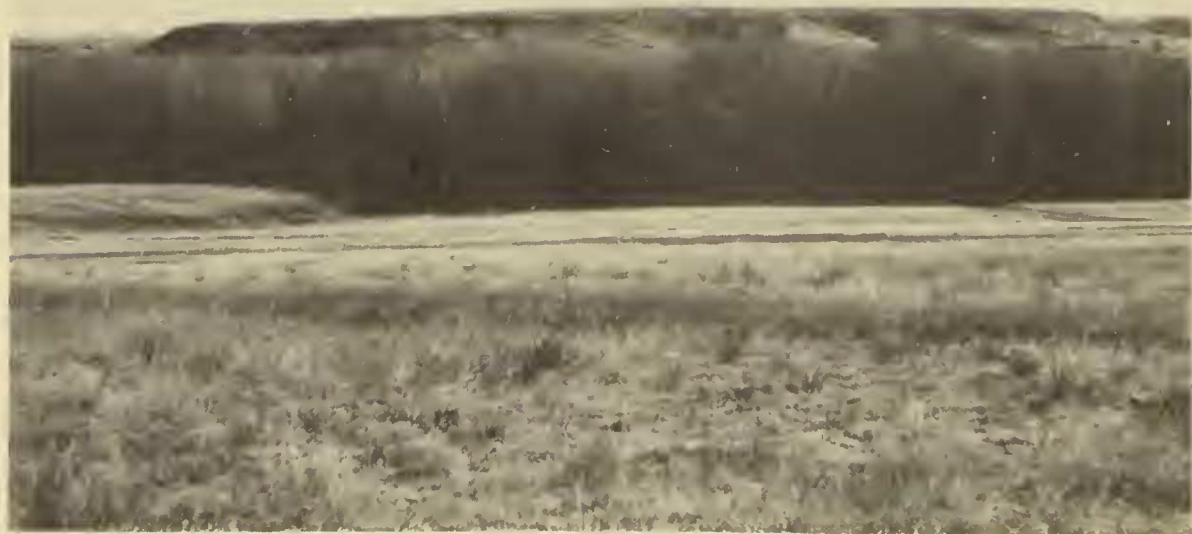
FIG. 10.—Riparian growth and scarps on Wolf Creek, southeastern Ochiltree County.

Illinois Museum of Natural History); UMMZ (University of Michigan Museum of Zoology). Also listed as additional records are specimens reported in the literature, with appropriate citation, from localities whence we did not examine material.